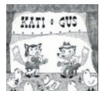
"Kati & Gus" 2003